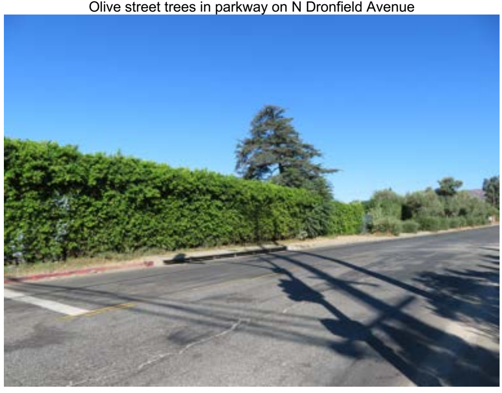
Site Photo Olive street trees in parkway on N Dronfield Avenue

No street trees in parkway on Polk Street